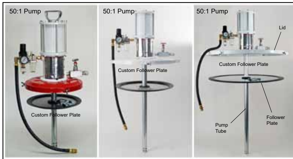
( LB3 ) Grease Pump Fits: 35 lb. Pail

The only difference between the grease pumps is the tube length, lid size & follower plate size for the 3 container sizes.