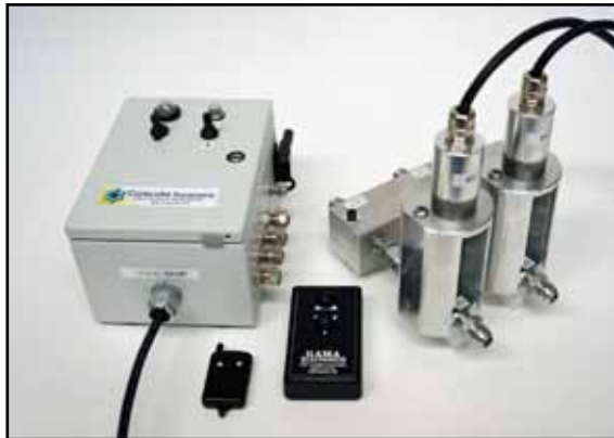
Optional Remote Control Flow Control Valve Units. Operate multiple pumps from a hand-held RF control.